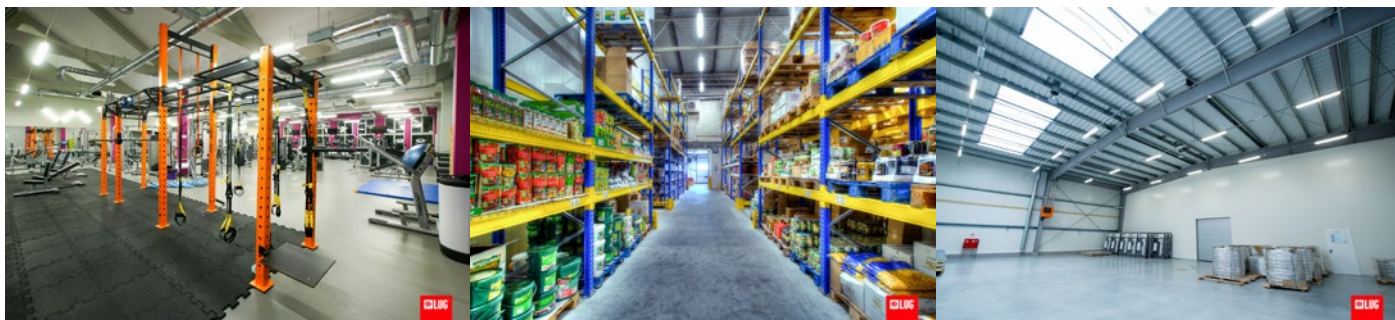
Everest Fitness, Zielona Gora, Poland