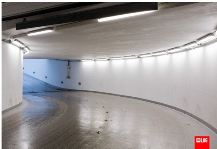
Kjøita Parkinghouse, Kristiansand, Norway